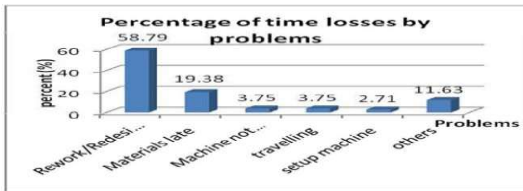
Figure 1: Percentages of Time Losses by Problems

Data already collected before started kaizen steps. From counter measure are proposed in why-why analysis, each current procedures of sales order processing flow are studied.