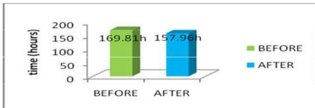
Figure 3: Sales order processing lead time comparison before and after improvements

been reduced. If we look at the hours reduced, it is a small value compared to overall time which is 169.81 hours. But, 11.85 hours time is more than one day because of 8 hours working time. That's a long time to waste.